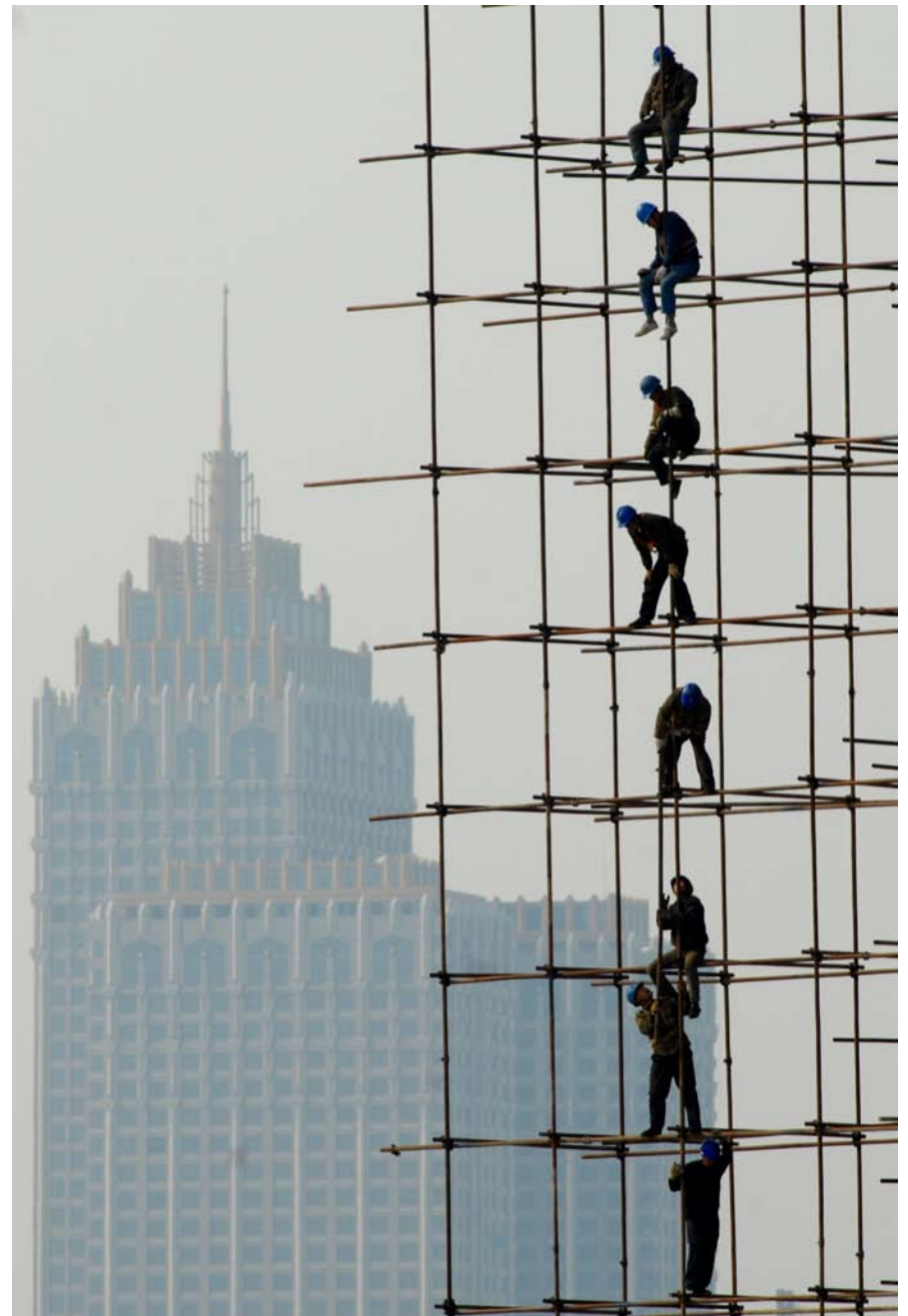
Workers erect scaffolding in Shenyang in NE China

If someone falls off, would the cause be a ‘fall from height’?